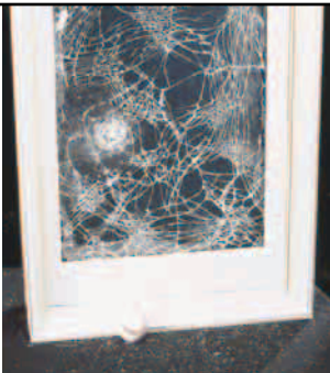
With safety and security window film

The general rule is the thicker the film, the stronger the film. But that's not always the case. What's crucial is impact- and tear-resistance. And 3M's got the best.