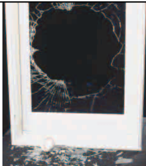
Without safety and security window film

Made of an exceptionally tough polyester, 3M™ Scotchshield™ Safety and Security Window Film is secured to the inside of windows with an aggressive adhesive system. It helps hold glass together, deterring smash-and-grab burglars and reducing the chance of glass shards falling or flying out.