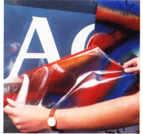
Graffiti is easily and cost effectively removed with VandalGARD protection.

Specific grades of VandalGARD comply with International Standards for safety glazing and human impact.